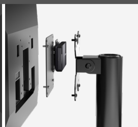
QUICK AND EASY TO SET-UP