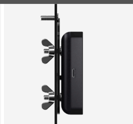
ACCESS TO PORTS AND BUTTONS