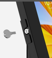
ANTI-THEFT DETERRENT ENCLOSURE