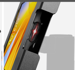
BARCODE SCANNER BUILT-IN