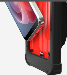
Dual Charging Capabilities POGO Pin & USB-C