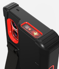
Integrated Scanner & Protective Case