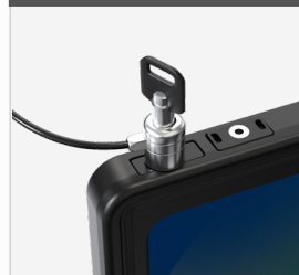
K-SLOT CABLE LOCK DESIGN