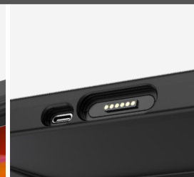
POGO and USB-C CHARGING PORT