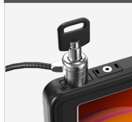
K-SLOT CABLE LOCK DESIGN