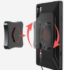
MAGNETIC TWIST LOCK