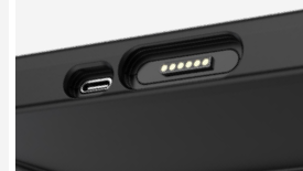
POGO and USB-C CHARGING TPORT