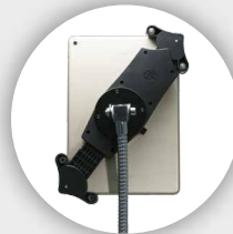
Adjustable Tablet Holder