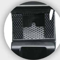
Anti-Slip Rubber Grips

CUSTOMIZABLE CLAMP GREAT FOR TABLES OR POLES