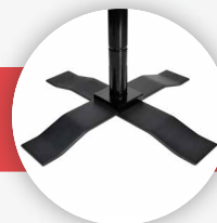
Stable Cross Base