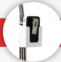
Attachable Battery-Pack Cradle