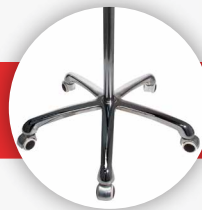
Easy-Roll Swivel Casters