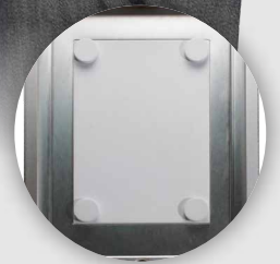
Interior Cushioning Protects Tablet