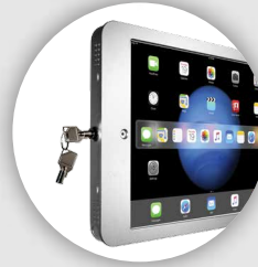
Locking Case and Key