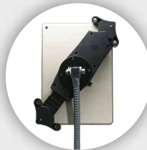
Adjustable Tablet Holder