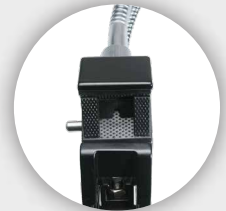
Anti-Slip Rubber Grips