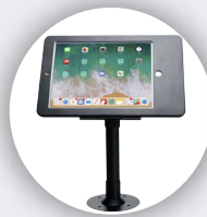
Vertical or Horizontal Viewing