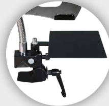
Attachable Accessory Tray