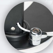
Security Cable with Key