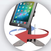
Rotates 360 Degrees