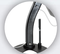
Cable Routing System