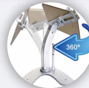
Rotates 360 degrees