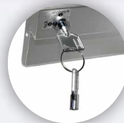
Anti-Theft lock with key