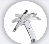
Adjustable viewing angle