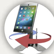
Rotates 360 Degrees