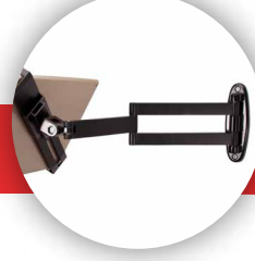
4 Pivoting Joints