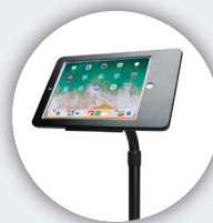
Vertical or Horizontal Viewing