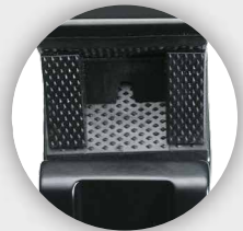
Anti-Slip Rubber Grips