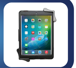
Holds Thick Cases