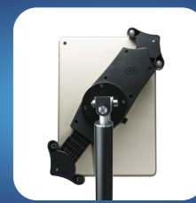
Adjustable Tablet Holder