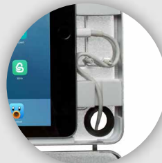
Cable Securing Management System