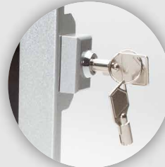
Locking Case with Keys