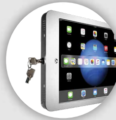
Locking Case and Key