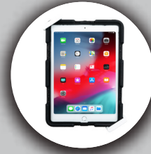
Universal holder to fit tablets with cases