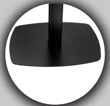
Sturdy Weighted Base