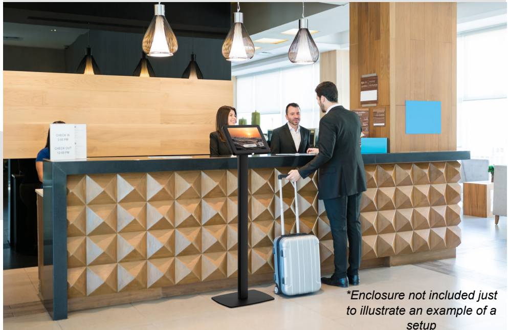
*Enclosure not included just to illustrate an example of a setup

This Premium Floor Stand features a thin profile metal pole which allows different Add-on components. It comes with a standard 75 x75 or 100 x 100-mm VESA plate mount compatible with CTA Digital's Paragon Premium Locking Wall Mount or any VESA standard Enclosures. It's ideal for trade-shows, retail stores and public interactive displays.