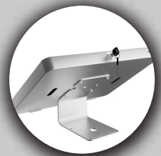
Fast & Simple Installation bolted or unbolted