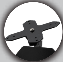
Flexible Universal VESA bracket