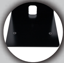
Heavy-Duty Steel Stand w/ Anchor Option