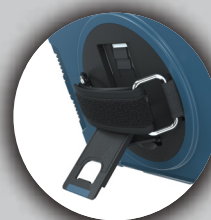
Built in Kickstand