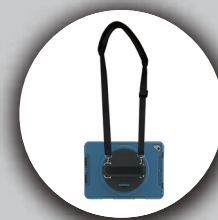
Shoulder Strap Attachment Option