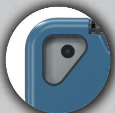
Openings for all Ports and Buttons