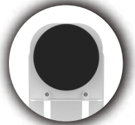
Magnet Mounting Component