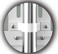
Clamp Mounting Option