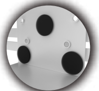
Protective Pads for Speakers