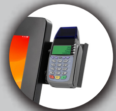
Card Reader Holder Component