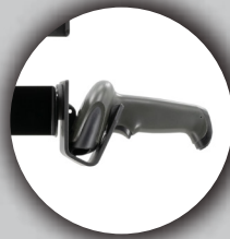
Magnetic Scanner Component