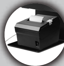
Printer Stand Component