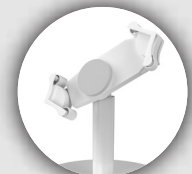
Adjustable Holder for a variety of sizes