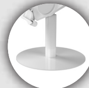
Sturdy Weighted Base