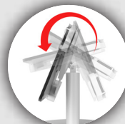
Flexible for desired Tilt