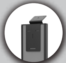
Seamless Connection to PARAF Floor Stands