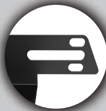
Openings Designed for Cable Management

*Floor Stand and Components Not Included and for Example Purposes