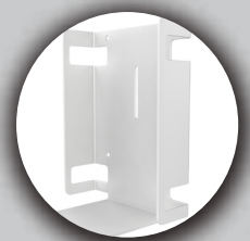
Well-Designed Holes for Seamless Threading of Velcro