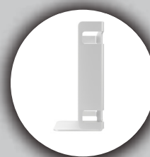
Compact and Durable Construction