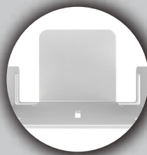
Sturdy Lip for Any Bottles to Rest on top of