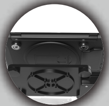
Quick Magnetic Mounting