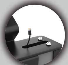
Built-in Cable Management