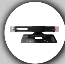
Adjustable Holder to Fit Laptops up to 17" Length