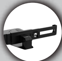
Anti-Theft Holder Security