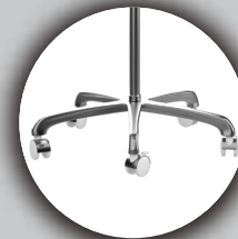
Locking Casters for Static Setups