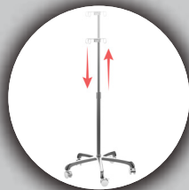
Ultra Flexible Height Adjustment

This rolling floor stand provides a secure rolling cart with hooks hang up to three bags of fluids for transfusions, IV drips, and other medical requirements. The sturdy steel and aluminum cart moves smoothly on five casters that lock in place with a convenient foot toggle. An adjustment knob allows for multiple height positions, making this floor stand versatile enough for hospitals, doctors' offices, clinics, home use, or any place a sturdy IV stand is required.