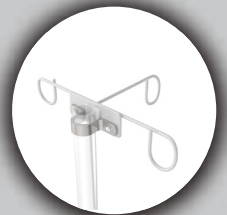
Adjustable Clamp Mount Infusion Bag Holder