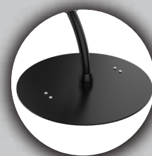
Sturdy Tabletop Work Area