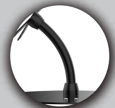
Efficient Cable Management