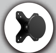
Strong Magnetic Connection