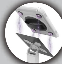
Quick and Easy Magnetic Mount to Hand Held Mode