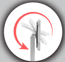
Ultra Flexible Tilt Adjustable