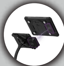
Wireless Inductive Charging Technology