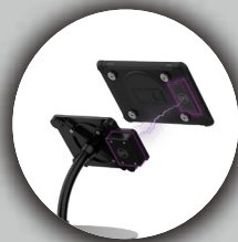
Wireless Inductive Charging Technology

You'll find ample space behind the graphics panel to route charging cables. The padded steel base provides a scratch-resistant and secure foundation for your stand – as well as CTA Digital's Inductive Charging Case (included). The case is drop-resistant, splash-proof, and is securely held to the floor stand via a universal VESA mount. To use, simply plug the case into your iPad's charging port. Then, align the case to the base. Electromagnetic fields charge your iPad. When ready to convert to handheld unit, simply pop the case off the base, slip your hand into the padded strap on the back, and you're ready to move. Return the iPad to the workstation to continue charging.