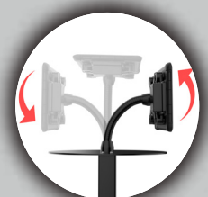
Ultra Flexible Gooseneck for Preferred Angles