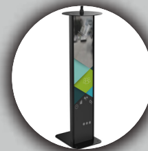
Customizable Graphic Slot