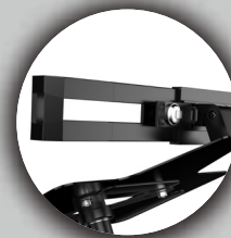
Anti-Theft Lock & Key Holder