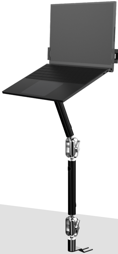
**Laptop Not Included