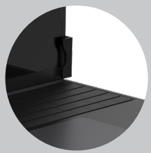
Stable & Secure Laptop Holder Grips