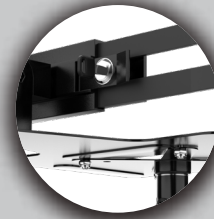
Lock & Key Holder Security