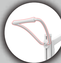
Height Adjustable Handle