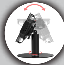
Tilt & Swivel Adjustability