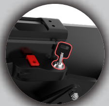
Security Lock System