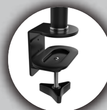
Sturdy Clamp Connection