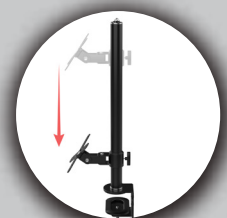
Height Flexible Versatility