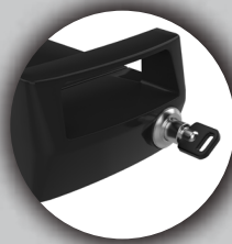
Built-In Anti-Theft Security