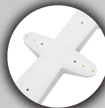
75x75 & 100x100 VESA Hole Compatibility