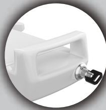
Built-In Anti-Theft Security