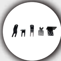
Assortment of Rail Mount Options