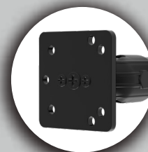
AMPS Mounting Base