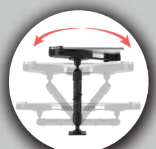
Ball Joint Adjustability